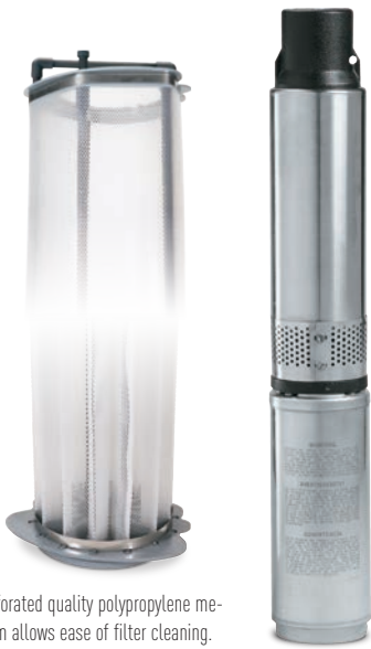
Perforated quality polypropylene medium allows ease of filter cleaning.

The powerful, yet lightweight DE Series features stainless steel construction, built-in overload and electric surge protection. Delta offers a wide range of pump selection for any application and incorporates features designed from our years of experience to provide you with trouble-free service.