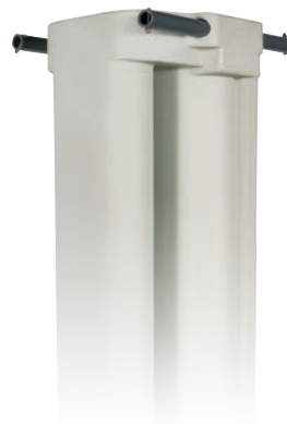
Rotational molded polyethylene housing with UV inhibitors for durability and shelf life.