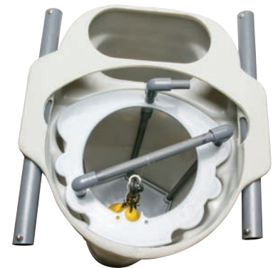
The ECOFILTER features a dual compartment design housing which can be used for your simplex or duplex application needs.